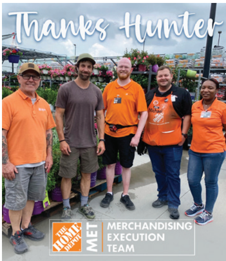
MET team presented our QC assembler with gifts to show their appreciation for everything he builds for 8460.