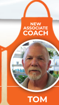
NEW ASSOCIATE COACH