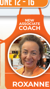
NEW ASSOCIATE COACH