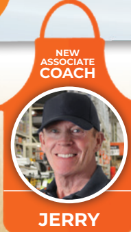
NEW ASSOCIATE COACH