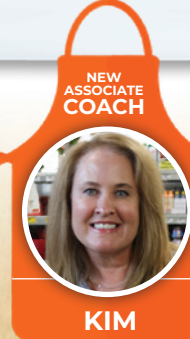
NEW ASSOCIATE COACH