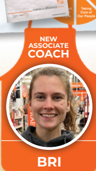
NEW ASSOCIATE COACH