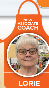
NEW ASSOCIATE COACH