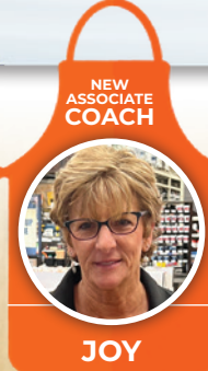
NEW ASSOCIATE COACH