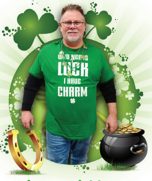
Saint Patrick's Day