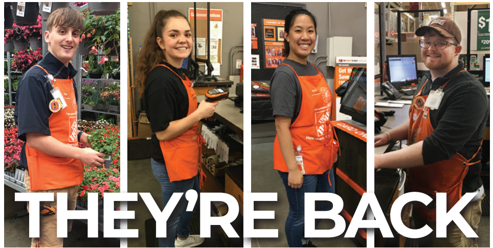
These great associates worked at 8460, then went off to college and are now BACK for the summer. So proud of all of you and happy to see your smiling faces back in the store.

A Don't be afraid to communicate your aspirations and goals! There are people who can and want to help you achieve and find your passion, but no one will know if you don't share! ■