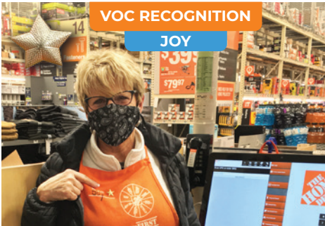
VOC RECOGNITION JOY