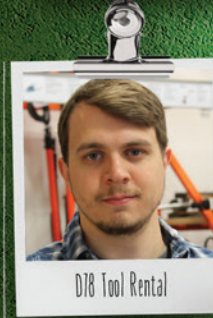
D18 Tool Rental