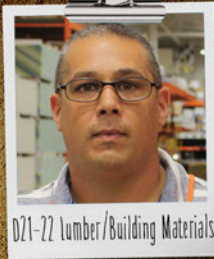
D21-22 Lumber/Building Materials