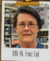
D90-96 Front End