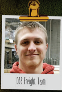
D58 Freight Team