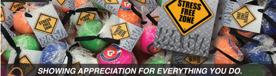
SHOWING APPRECIATION FOR EVERYTHING YOU DO.