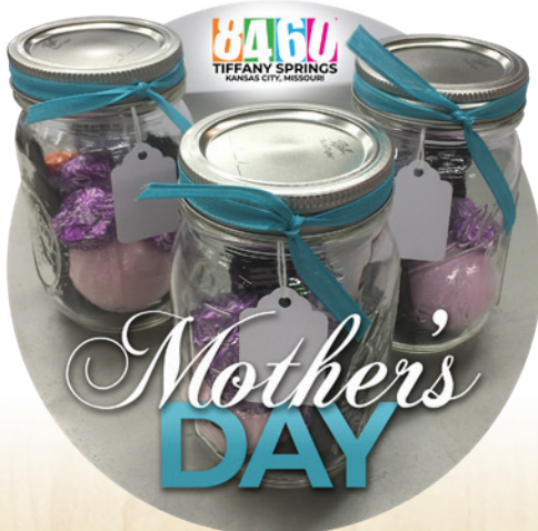
Thanks to Hollie for putting together these wonderful Mother's Day gifts for all the Mom's @ 8460.