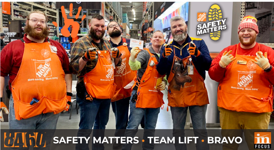
8460 SAFETY MATTERS • TEAM LIFT • BRAVO