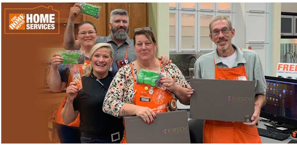
Specialty Tuesday had the Rockwood blinds and shutter Rep stop and talk with us. We got socks!!!