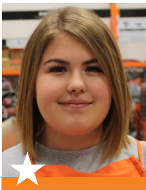
2ND - Kanyon