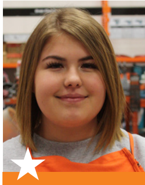
2ND - Kanyon